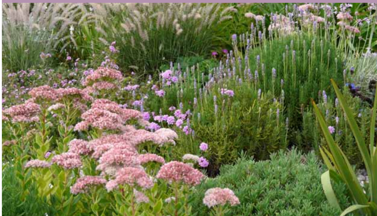
first prize in 2009 Photo competition

Société Nationale d'Horticulture de France